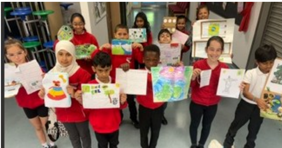
Year 4 showing some of their amazing Brazil home projects. Keep up the great work!