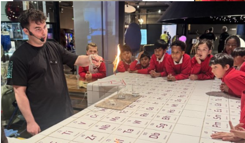
Year 4 at the Wonder Lab.