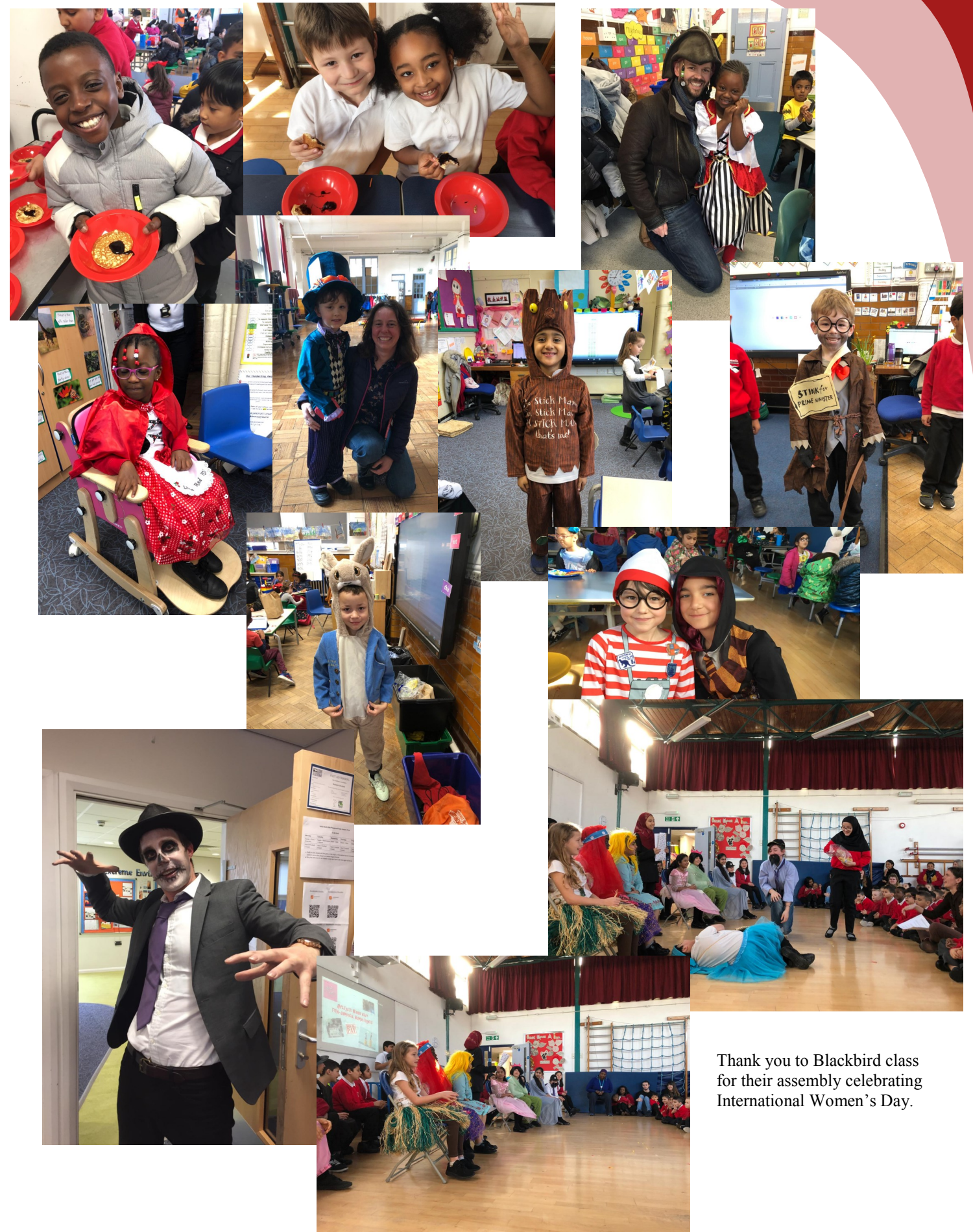
Thank you to Blackbird class for their assembly celebrating International Women's Day.