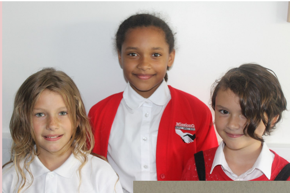
SCHOOL CAPTAINS NORTH SITE