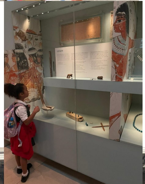
Year 4 British Museum